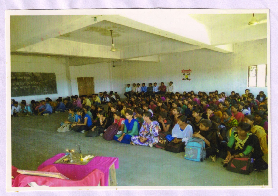
students of college Attending workshop