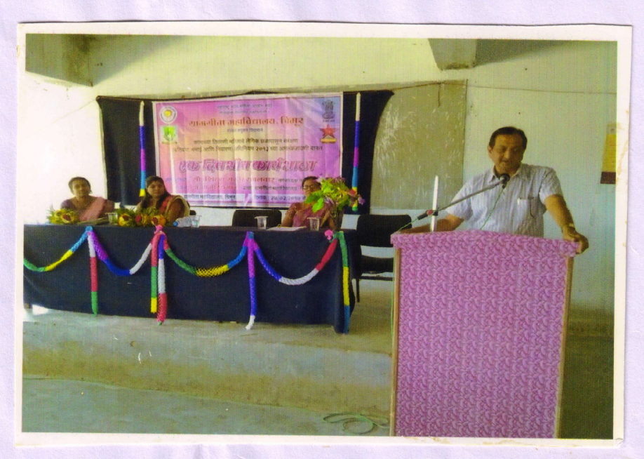
Chair person of programme and principal of the collège addressing students.