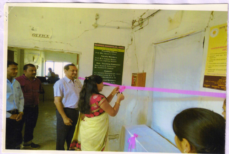
Inauguration of Women Complaint Box